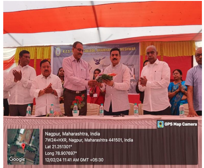
Guest Lecture Event at College