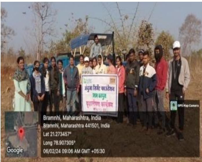
Visit at Ambuja Cement factory and Plantation