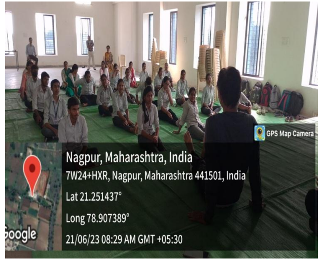
Yoga for health