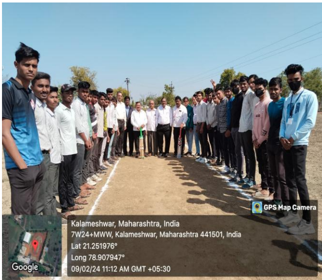
Inauguration of Sports competition on College Ground