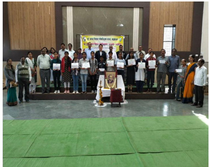
Prize winners participated in various events