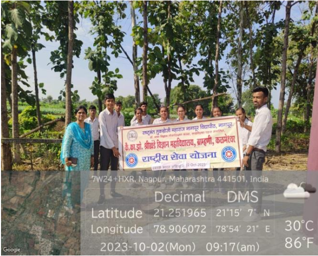
Field work by the students