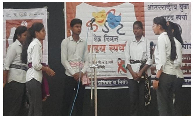
Drama by students at NSS camp Waroda