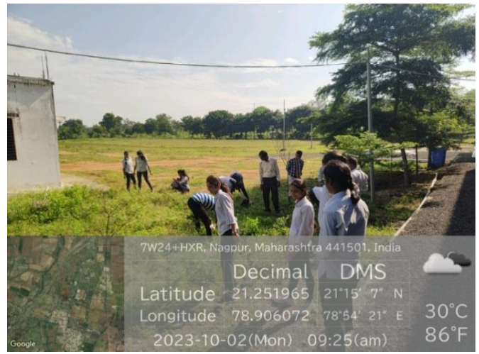
Cleaning of village Waroda