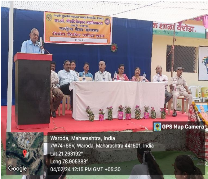
Inauguration of Special NSS Camp at Waroda