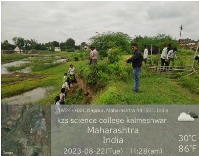
Shramadan in NSS camp at Waroda